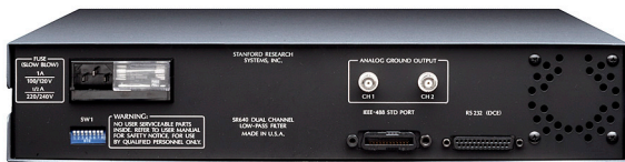
SR640 rear panel