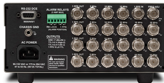
FS725 rear panel (with Opt. 03)